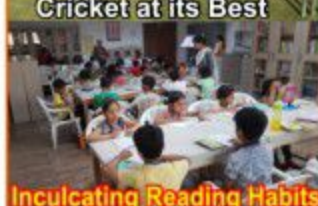
Inculcating Reading Habits