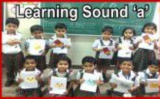
Learning Sound 'a'