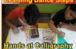
Hands at Calligraphy