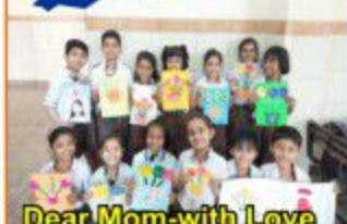
Dear Mom-with Love