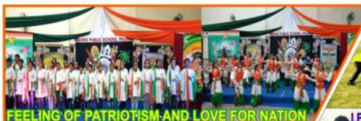
FEELING OF PATRIOTISM AND LOVE FOR NATION