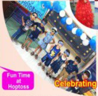
Fun Time at Hoptoss