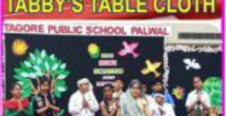
TABBY'S TABLE CLOTH