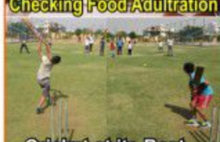
Cricket at its Best