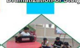
Importance of Patience