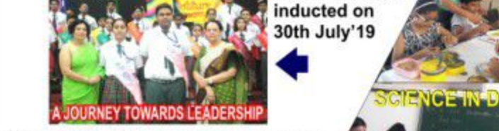
A JOURNEY TOWARDS LEADERSHIP