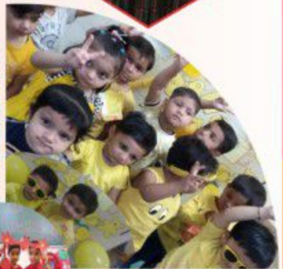
Celebrating Colours as powerful communication tool.