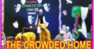
THE GROWDED HOME