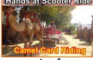
Camel Gard Riding