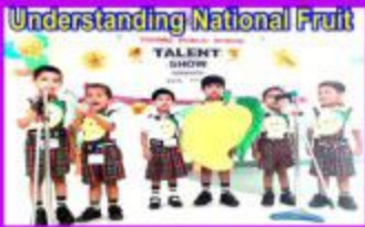
Understanding National Fruit

Learning with hands gives pleasure to children and makes learning fun. Learning through recitation makes the child physically and emotionally fit. Learning through curiosity makes learning interactive. Hence, Tagore provides its tiny-tots learning opportunities through various crafts like Tearing and pasting, Memory game, Talent show, Sense organs, Corn activity, Fun with consonants, Story time activities, Show and Tell, Traffic Safety rules etc. to name a few.