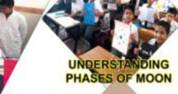
UNDERSTANDING PHASES OF MOON