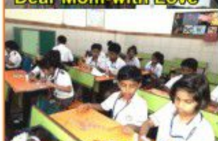
Making of Krishna Crown