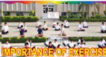
IMPORTANCE OF EXERCISE