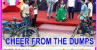
CHEER FROM THE DUMPS