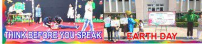
Text book stories live on stage