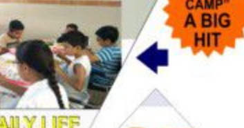
LEARNING TABLE MANNERS