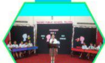
News Reading Competition