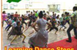
Learning Dance Steps