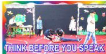
THINK BEFORE YOU SPEAK