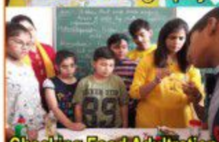
Checking Food Adulteration