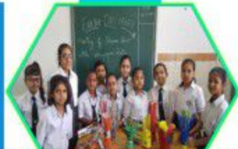
Making of Flower Vase