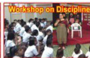
Workshop on Discipline