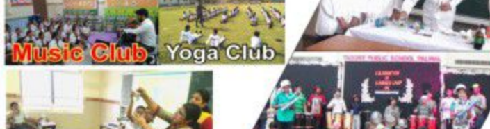
Music Club, Yoga Club