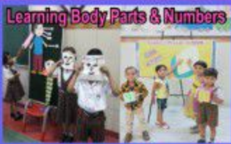
Learning Body Parts & Numbers