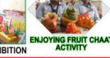
ENJOYING FRUIT CHAAT ACTIVITY