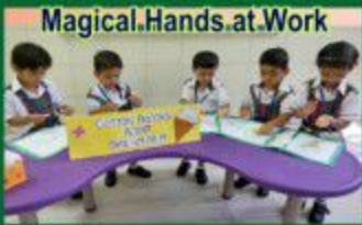
Magical Hands at Work