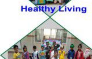
Festivals of India