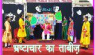
भ्रष्टाचार का ताबीज