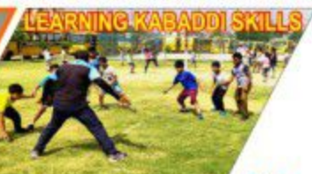
LEARNING KABADDI SKILLS