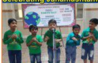
Earth Day Celebration