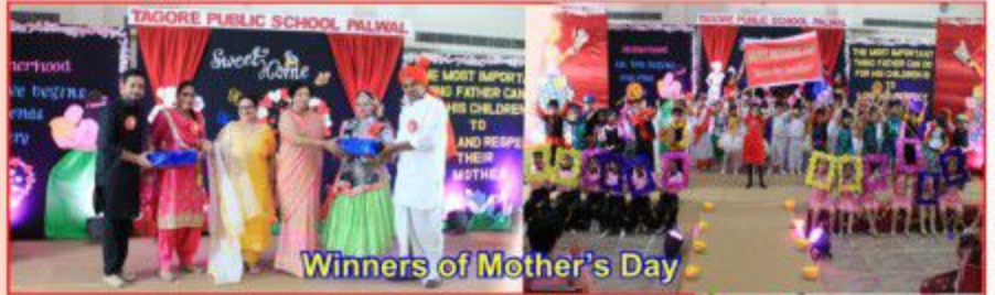
Winners of Mother's Day

Learning with hands gives pleasure to children and makes learning fun. Learning through recitation makes the child physically and emotionally fit. Learning through curiosity makes learning interactive. Hence, Tagore provides its tiny-tots learning opportunities through various crafts like Tearing and pasting, Memory game, Talent show, Sense organs, Corn activity, Fun with consonants, Story time activities, Show and Tell, Traffic Safety rules etc. to name a few.