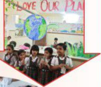
LOVE OUR PLANET