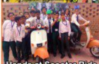
Hands at Scooter Ride