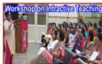
Workshop on Interactive Teaching