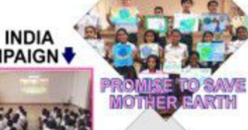
PROMISE TO SAVE MOTHER EARTH