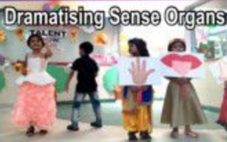
Dramatising Sense Organs