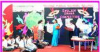
THE REAL JEWELS