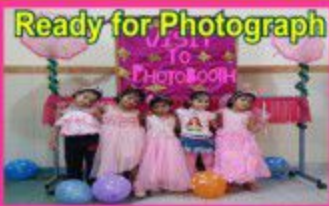
Ready for Photograph